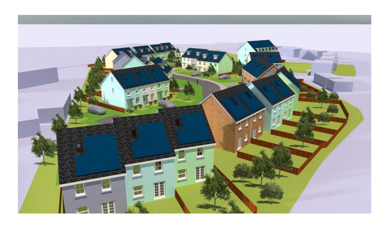
Figure 8: View to the north capturing the whole site – Lle Dymunol (Pleasant Place)