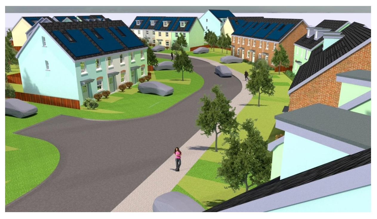
Figure 7: Vehicular turning are to allow safe access and egress