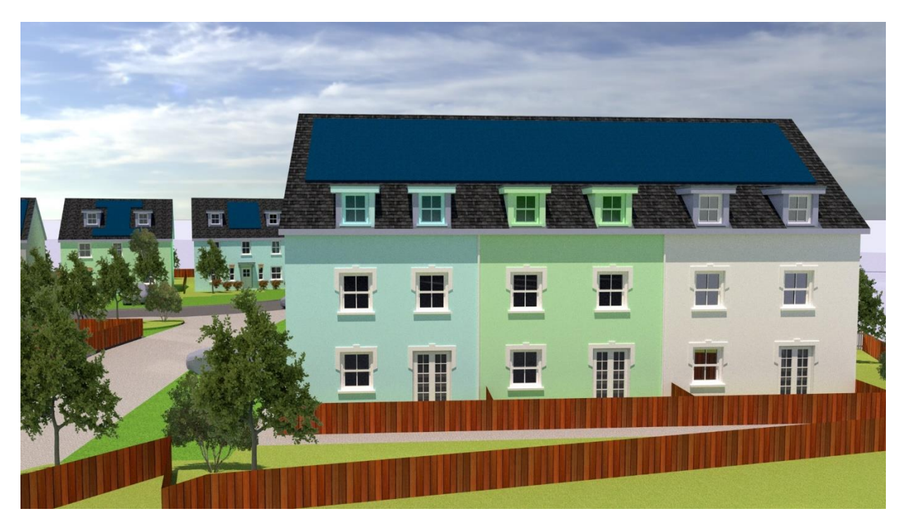
Figure 9: Meticulous design complimenting house designs but delivering 1 bed apartments