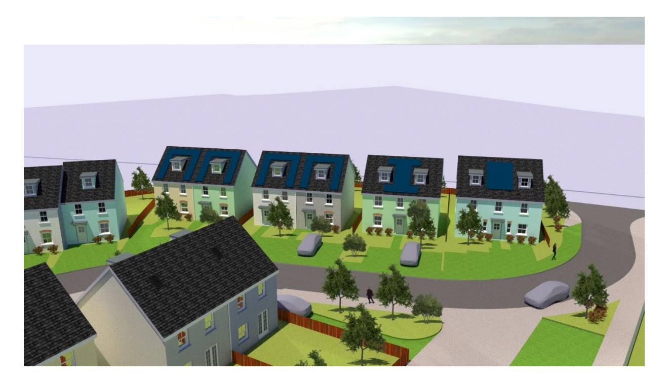
Figure 3: Examples of house type and layout

a balanced housing stock, in that local area". The scheme provides a range of 1, 2, 3, 4 and 5 bedroom dwellings.