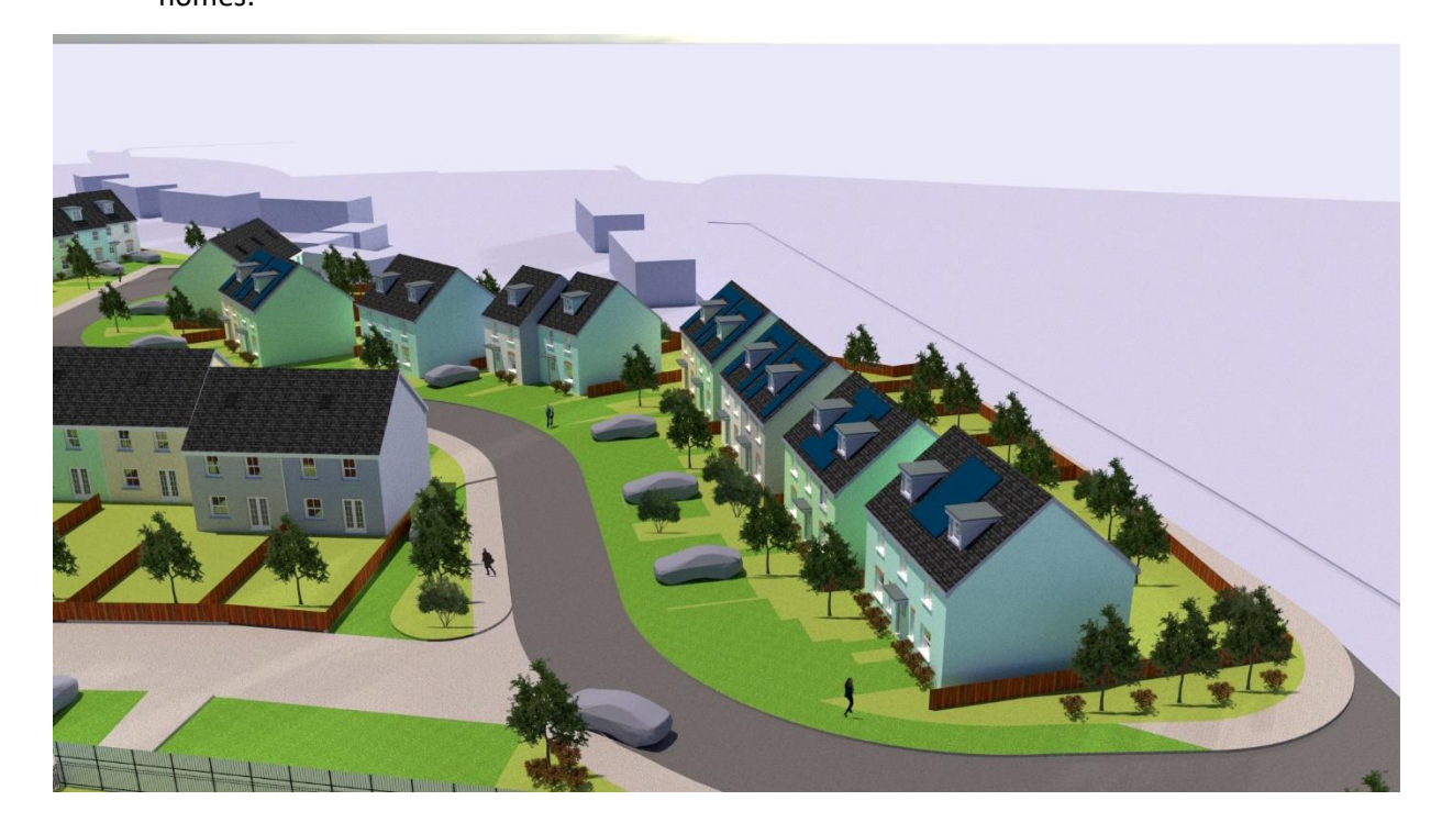
Figure 5: Welcoming and pleasant site entrance

as the site is brownfield land, however with the introduction of green infrastructure the proposed development will enhance the visual amenity of the site whilst also delivering 41 no. homes.