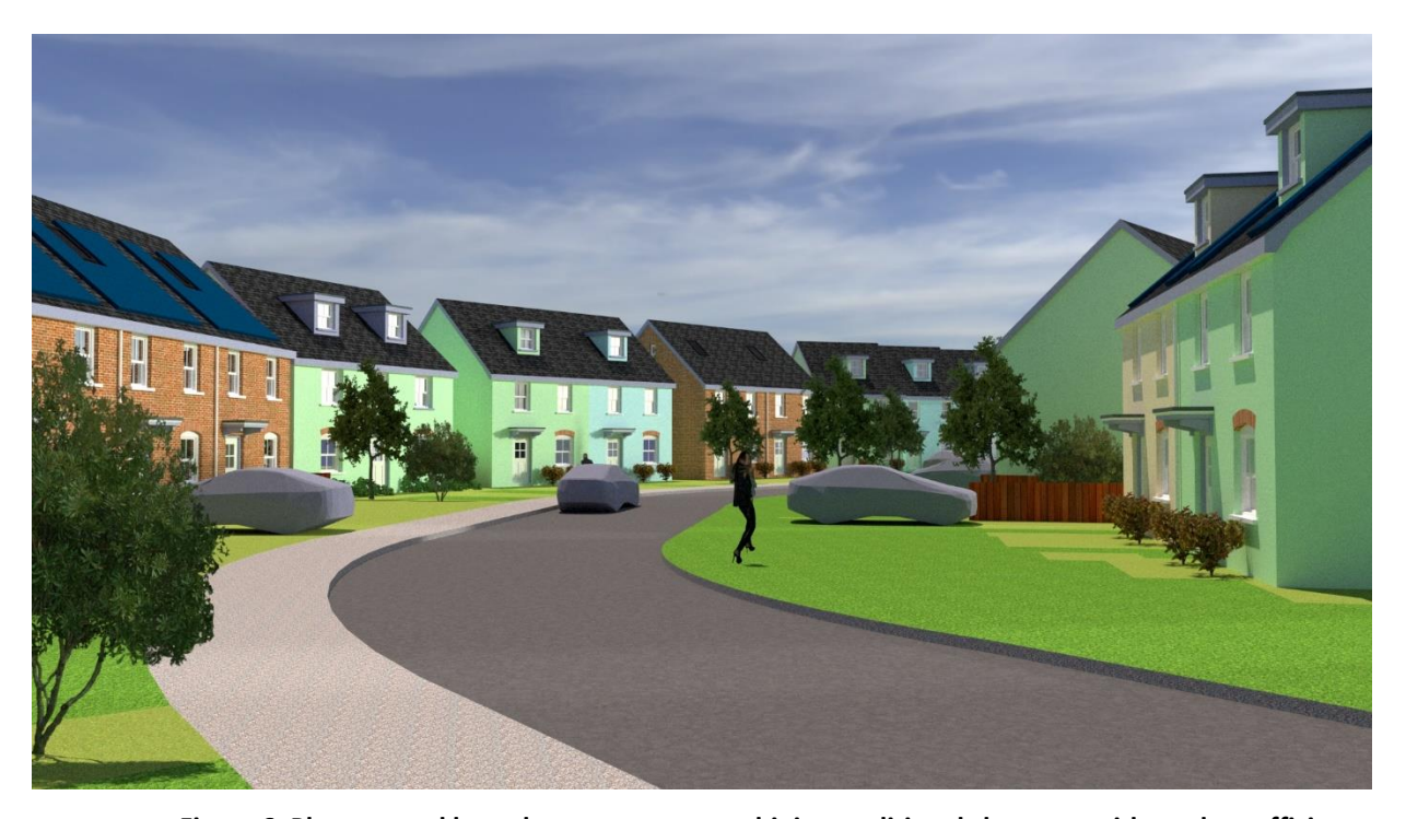
Figure 6: Pleasant and homely street scene combining traditional character with modern efficiency