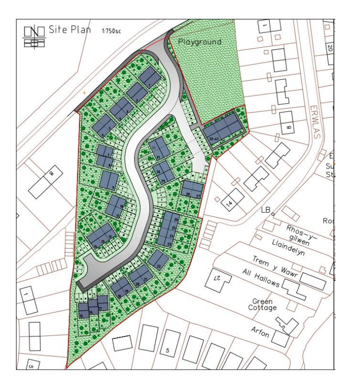
Figure 2: Proposed Site Layout Plan