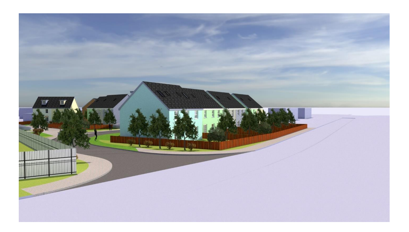
Figure 12: Existing access to be improved to provide 5.5 m wide road and 2.0m pavements each side ensuring safety