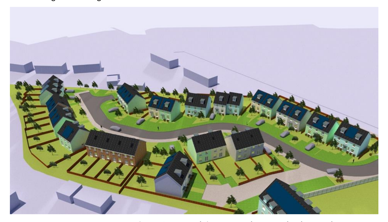
Figure 10: Proposed site Layout – Lle Dymunol – Pleasant Place

8.1 The proposed site layout will see all dwellings with their principal elevations facing onto the estate road, with their gardens to the rear and parking to the front. Each dwelling will afford its own private amenity space and parking spaces. The site layout will respect the form and outlook of the existing surrounding built form.